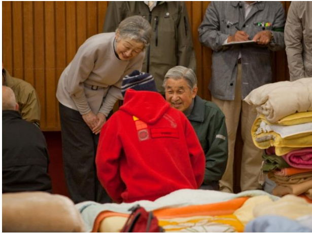
Kitaibaraki, April 22, 2011