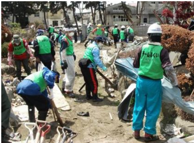
Volunteers clear debris, Miyagi Prefecture, May 2011