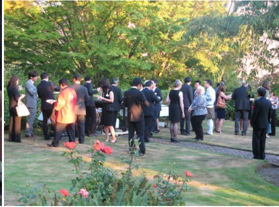
Networking among participants

This is the second delegation from Mie to Washington in the past two years, and the two regions are working hard to develop close partnerships. With the new MOU in place, we expect that business exchange will grow and that Iga beef and other Mie products will spread throughout the Pacific Northwest.