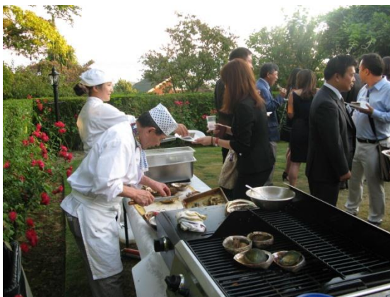
Grilled Mie abalone