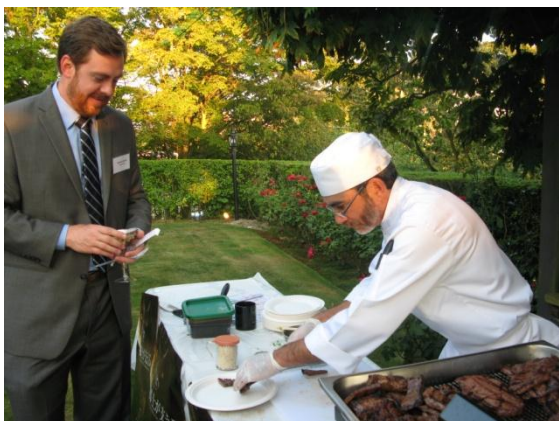
Grilled Iga beef

At the reception, guests enjoyed Mie delicacies including Iga beef, abalone, and sea bream (tai), that were shipped directly from Japan especially for the event. Iga beef was introduced in the U.S. for the first time by representatives of Mie’s cattle industry who had the opportunity to meet face-to-face with potential customers from local food-related businesses at the event. The 50-member Mie delegation, which also included representatives of the prefecture’s manufacturing and medical sectors, along with Mie University, were able to deepen their network with the local guests.