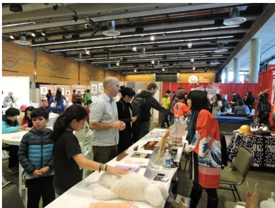
Cherry Blossom & Japanese Cultural Festival

The 110th anniversary of the Wakayama Club in Seattle was honored with a visit by Governor Nisaka of Wakayama Prefecture, as well as a group of business representatives. In addition to a speech by Governor Nisaka, promotional activities for products made in Wakayama Prefecture, such as umeboshi (pickled plums), umeshu (plum brandy), soy sauce, and mandarin juice, also took place.