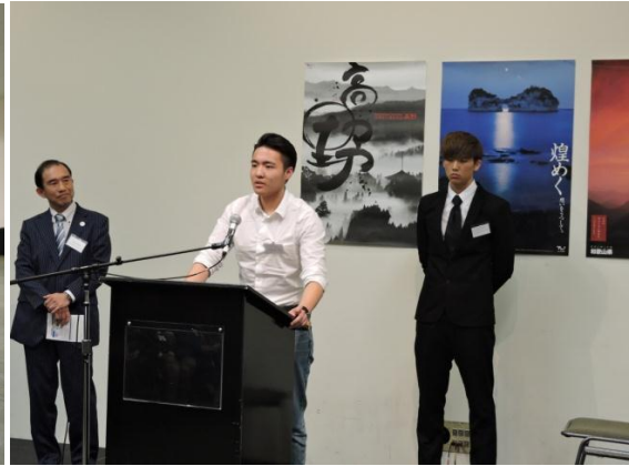
Japanese Speech and Skit Contest

With beautiful weather, the many participants and visitors fully enjoyed the festival, and the events brought great opportunities for them to get closer to Japanese culture.