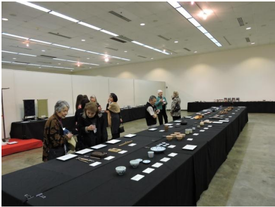
The Japan Foundation's traveling exhibit