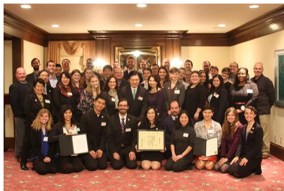
JET Alumni with Consul General Omura