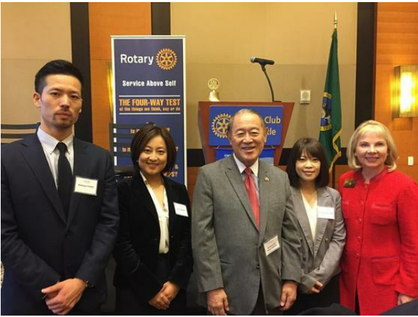
Walk in U.S. Delegation at the Rotary Club of Seattle's luncheon