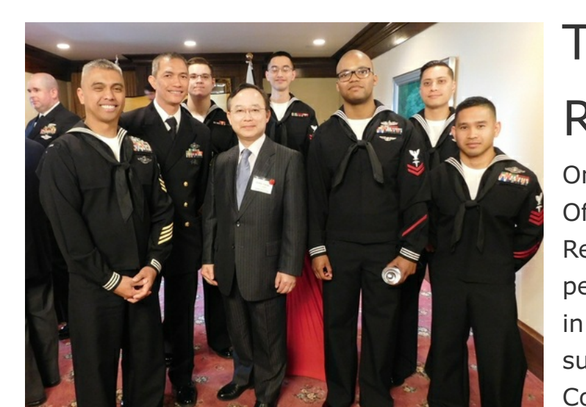
On April 24, at the Consul General's Official Residence, the Tomodachi Reception was held for U.S. Navy personnel who have been stationed in Japan. The event was the fourth such reception hosted by the

The 55-year anniversary of the sister-state relations between the State of Washington and Hyogo Prefecture will be celebrated in July. For more information about Hyogo-related sister-state and sister-cities relations and events, please contact Hyogo Business and Cultural Center.