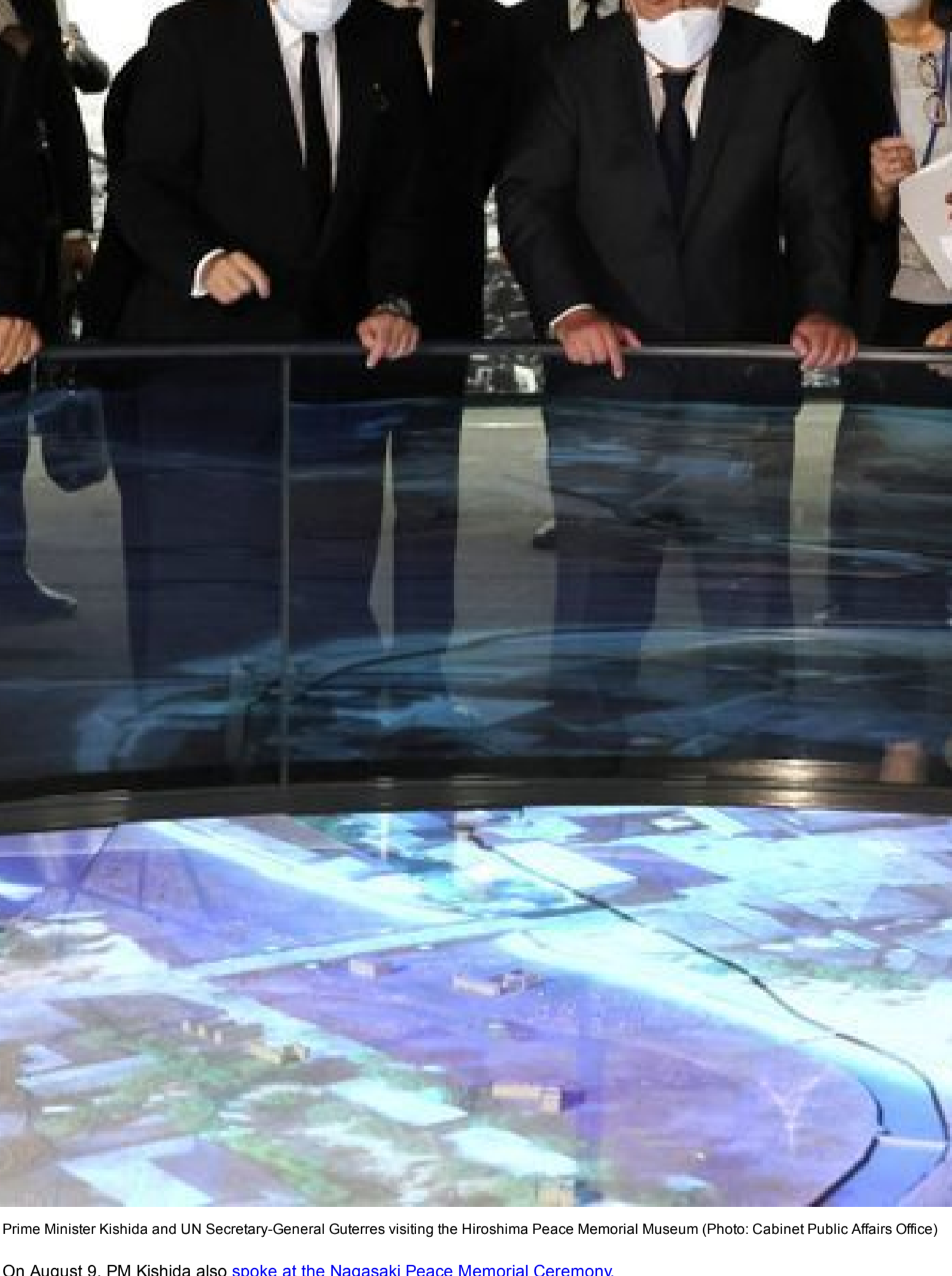
Prime Minister Kishida and UN Secretary-General Guterres visiting the Hiroshima Peace Memorial Museum

Following the meeting, Mr. Guterres and PM Kishida visited the Hiroshima Peace Memorial Museum.