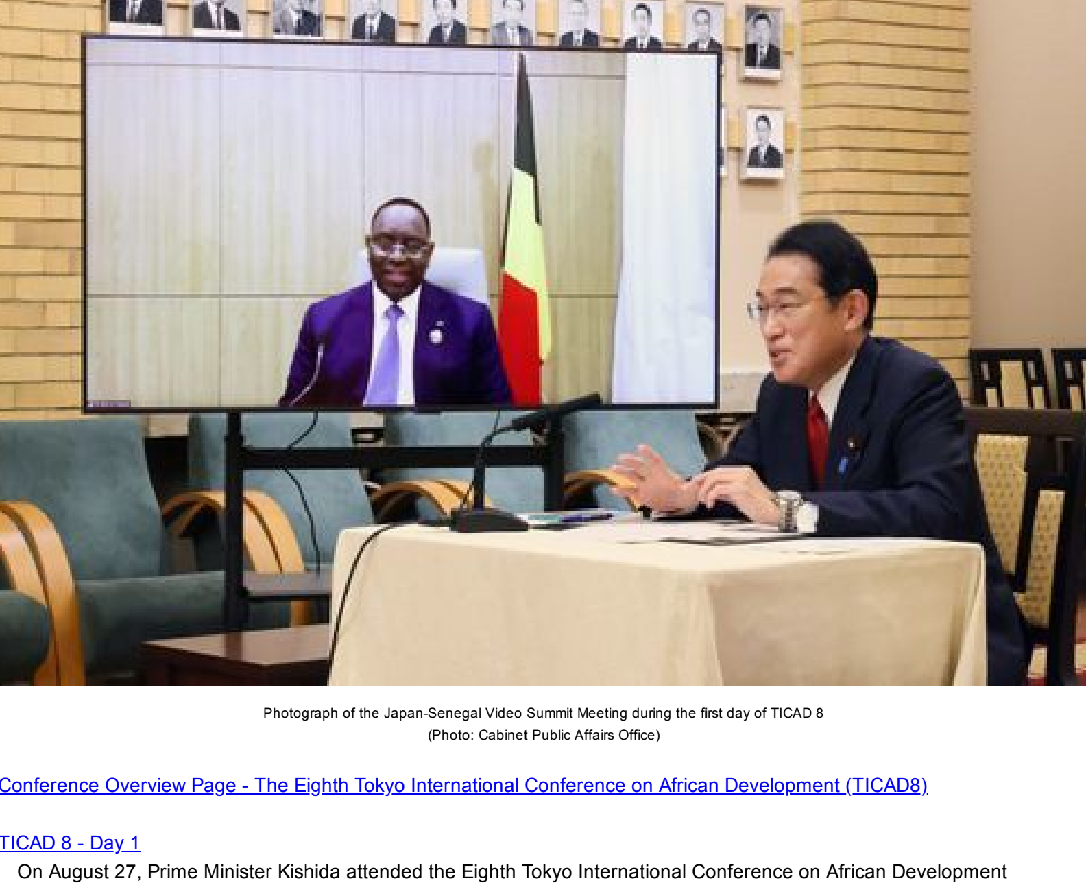
Photograph of the Japan-Senegal Video Summit Meeting during the first day of TICAD 8

Conference Overview Page - The Eighth Tokyo International Conference on African Development (TICAD8) TICAD 8 - Day 1 On August 27, Prime Minister Kishida attended the Eighth Tokyo International Conference on African Development (TICAD8) held in Tunisia by video conference from the Prime Minister's Official Residence. The Prime Minister attended the opening session and delivered an opening speech, followed by video summit meetings with leaders from Senegal, Libya, Tanzania, and Egypt. The Prime Minister then attended the Business Forum and delivered a video message. TICAD 8 - Day 2 On August 28, the Prime Minister attended the the Fourth Hideyo Noguchi Africa Prize Award Ceremony and delivered a video message , followed by video conference meetings with leaders from South Sudan, the Republic of Djibouti, and the African Union Commission (AUC).