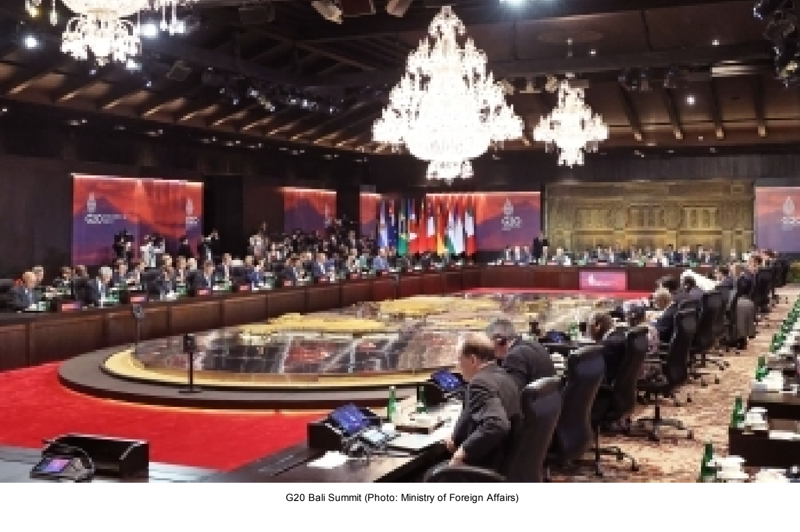
G20 Bali Summit

The two leaders concurred to continue close coordination between Japan and the U.S. toward the success of the G7 Hiroshima Summit Meeting in 2023.