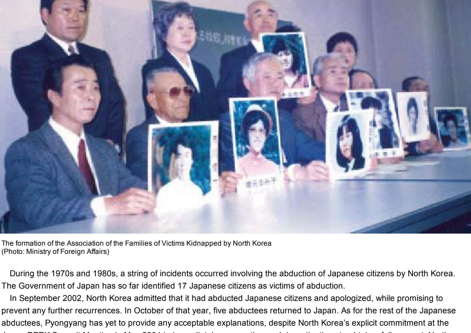
The formation of the Association of the Families of Victims Kidnapped by North Korea

During the 1970s and 1980s, a string of incidents occurred involving the abduction of Japanese citizens by North Korea. The Government of Japan has so far identified 17 Japanese citizens as victims of abduction. In September 2002, North Korea admitted that it had abducted Japanese citizens and apologized, while promising to prevent any further recurrences. In October of that year, five abductees returned to Japan. As for the rest of the Japanese abductees, Pyongyang has yet to provide any acceptable explanations, despite North Korea's explicit commitment at the Japan-DPRK Summit Meeting in May 2004 to immediately resume thorough investigations to obtain a full account. North Korea's assertions regarding the abductions issue have not provided any satisfactory account or convincing evidence, and therefore, the GoJ finds them unacceptable.