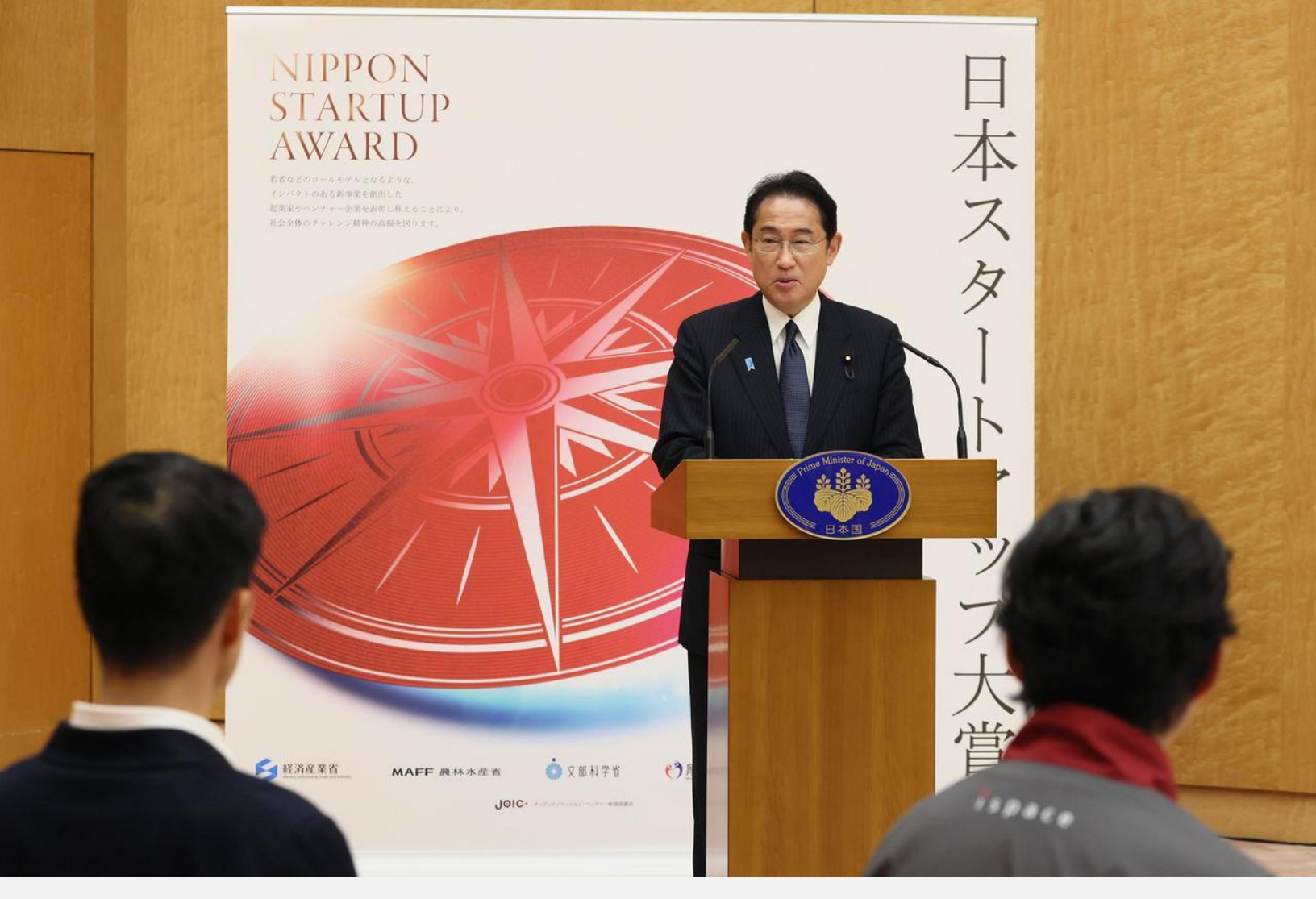
On June 9, 2023, Prime Minister Kishida attended the awards ceremony for the Nippon Startup Award 2023 at the Prime Minister's Office.