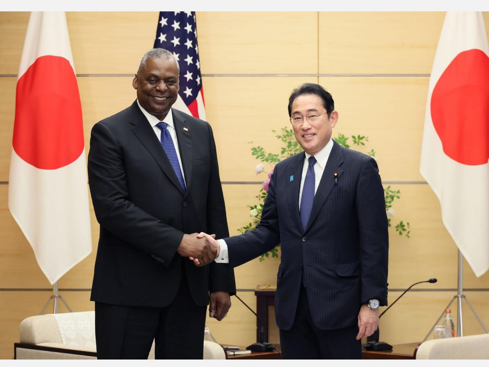
On June 1, 2023, Prime Minister Kishida received a courtesy call from The Honorable Lloyd Austin III, United States Secretary of Defense, at the Prime Minister's Office.