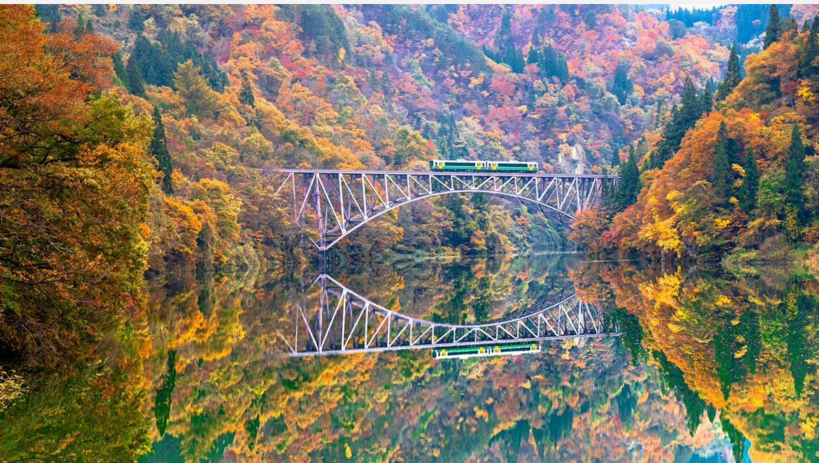
No. 1 Tadami River Bridge, Mishima Town, Fukushima

You can find past issues of the newsletter here .