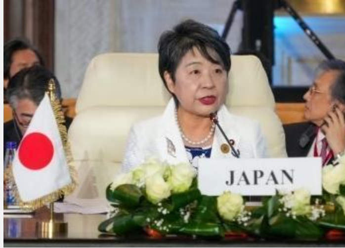
FM Kamikawa speaks at the Cairo Summit for Peace on October 21

Japan has unequivocally condemned the recent terror attacks by Hamas and other Palestinian militant groups against Israeli civilians and territory on October 7. These attacks and kidnappings, especially those targeting innocent civilians, are unjustifiable. Japan's top priorities are the immediate release of hostages, securing the safety of civilians, all parties acting in accordance with international law, and calming the situation as soon as possible.