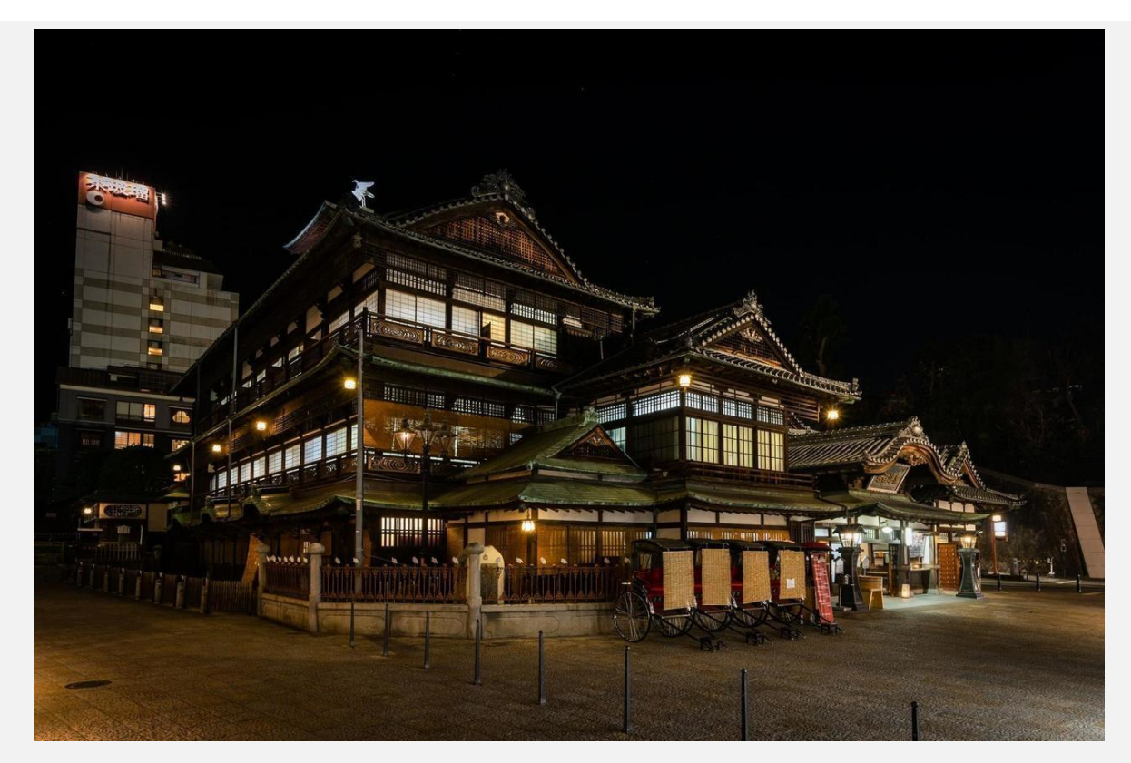
Dogo Onsen, Ehime Prefecture

Experience the flavors of Ehime Prefecture, known as the "Citrus Kingdom" of Japan. Go to Uwajimaya for food tastings, a live tuna cutting event, and explore a variety of specialty seafood and citrus products that showcase the region's delicious offerings.