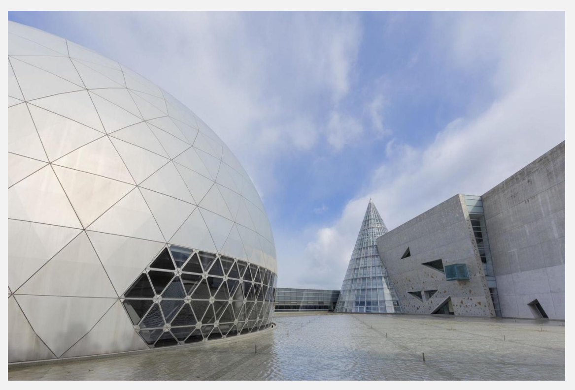
Ehime Prefectural Science Museum

You can find past issues of the newsletter here.