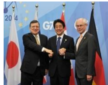
G7 Summit 2014 in Brussels