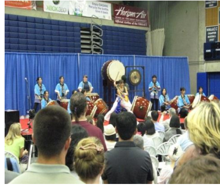
School of Taiko Performance, Main Stage (CGJ, Seattle)