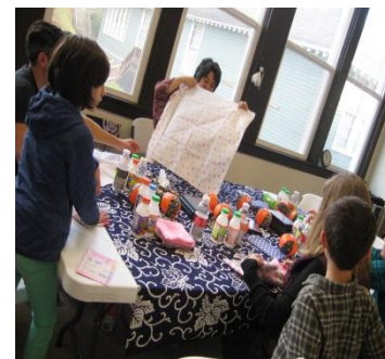
Furoshiki Workshop (JCCCW)

Please visit the Consulate General of Japan booth to learn furoshiki wrapping techniques; meet PARO the therapeutic harp seal robot; discover interesting facts about Japanese culture and gather travel brochures for planning your trip to Japan!