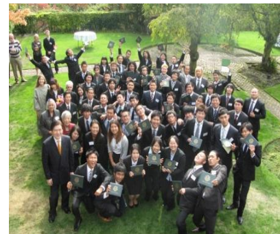
JATP 2014 Graduates(CGJ, Seattle)

A special graduation ceremony was held at the Official Residence. Fifty-eight visiting trainees from Japan graduated after completing their participation in the Japanese Agricultural Exchange Program (JATP). This 19-month-long work/exchange educational program is sponsored by the Japan Agricultural Exchange Council (JAEC).