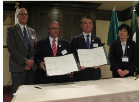
MOU Signing

Washington State and Mie Prefecture signed a Memorandum of Understanding (MOU) on the establishment of a partnership to promote two-way economic development, with a focus on the aerospace and life-science industries.